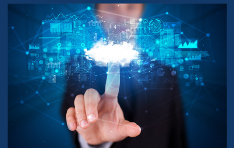
SSO & API Ready