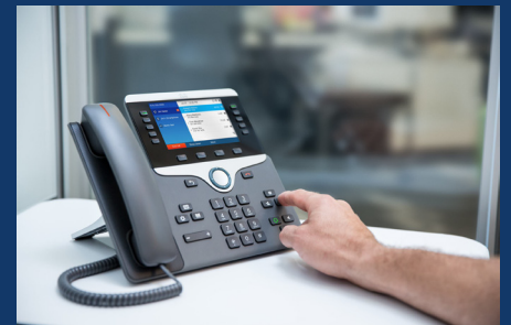
No DID's Required