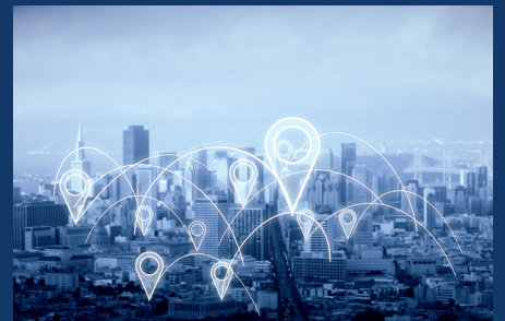
HELD Location Switching