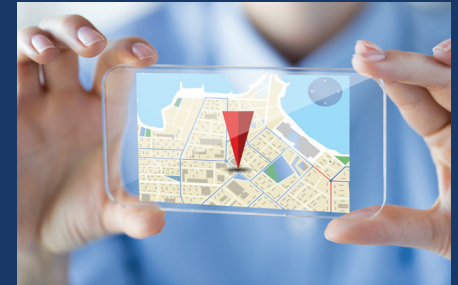
Auto Location Tracking